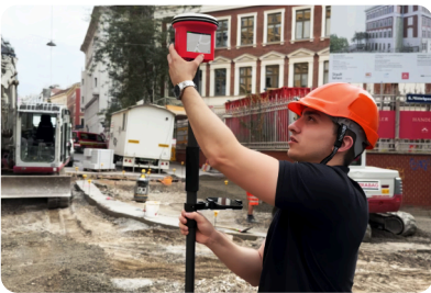
SURVEY & STAKEOUT