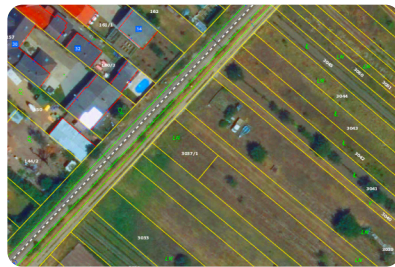
GIS & MAPPING